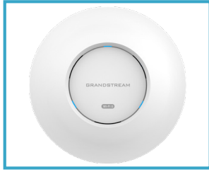
GWN7660 Wi-Fi 6 Indoor Access Point