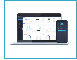
GWN.Cloud Cloud Management Platform