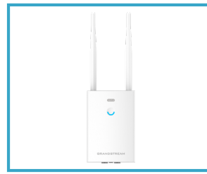
GWN7660LR Outdoor Long-Range Wi-Fi 6 Access Point Outdoor areas