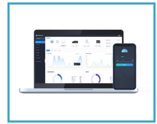
GWN.Cloud Cloud Management Platform Access Point Management