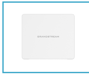
GWN7602 Wi-Fi AP with Integrated Ethernet Switch Hotel Rooms