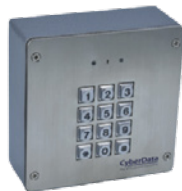
011433 Secure Access Control Keypad