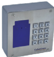
011426 RFID/Keypad Secure Access Control Endpoint