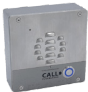
011186 SIP Outdoor Intercom