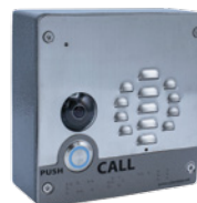
011410 SIP h.264 Video Outdoor Intercom