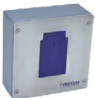
011425 RFID Secure Access Control Endpoint